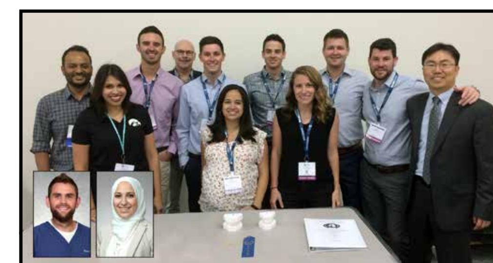
Iowa Orthodontics Residency Program American Association of Orthodontics' Resident Care Competition, first place (2017) and fourth place (2018) out of almost 70 orthodontic residency programs, which continues a streak of top finishes with three first place finishes in the last five years